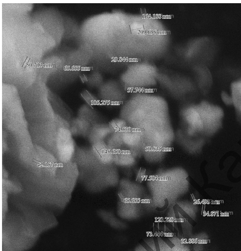
Fig. 1. Electron photomicrograph of \text{NdCa}_2\text{CuMnO}_6 .

bined with the processing of experimental data was no more than 2.5 h. The limit of the allowable error was \pm 10\% [6, 7].